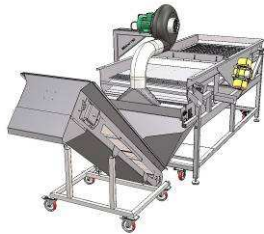
Mistral® 100 OLC NG with elevator